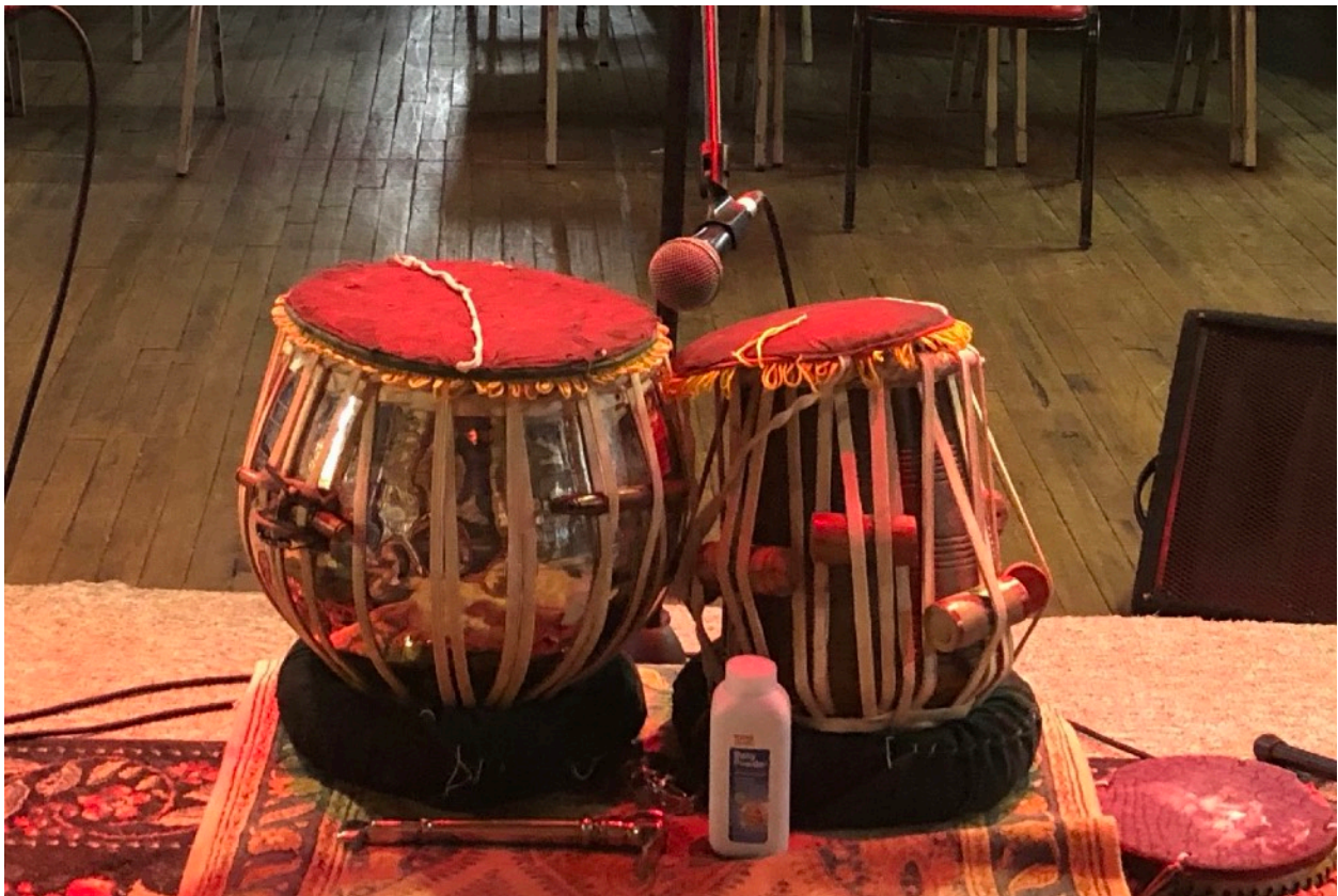
Tabla Mic Angle